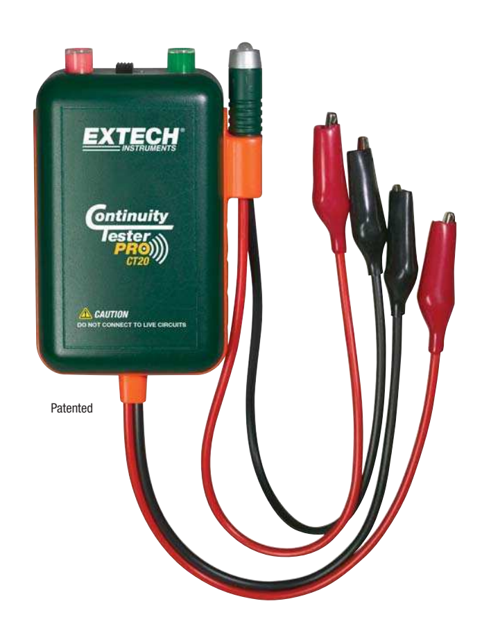
Continuity Tester includes Remote probe with bi-color LED for wire identification highlight