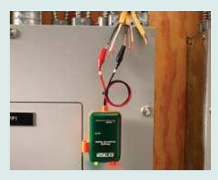
Use for local continuity or for remote wiring identification.